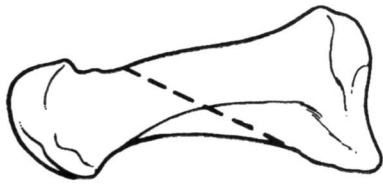
FIGURE 4 Medial view of the Mau osteotomy.

The osteotomy is stabilized with a bone clamp and a 0.045-inch Kirschner wire is drilled perpendicular to the osteotomy from dorsal to plantar just distal to the end of the plantar cut. The purpose of the wire is to act as a pivotal rotation axis. Once the Kirschner wire is inserted, the bone clamp is removed and the plantar shelf is rotated laterally on the dorsal shelf to reduce the IM angle. We stress that this is a rotational osteotomy and not a transpositional one. Hence the plantar fragment is rotated and not displaced. Proximal to the Kirschner wire there is almost full bony contact between the fragments. The bone clamp is now reapplied to stabilize the osteotomy in its corrected position.